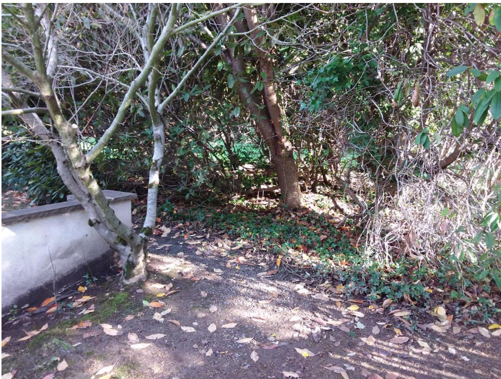
Figure 4. Looking ENE at the base of the #46 vine maple and the #45 cherry.