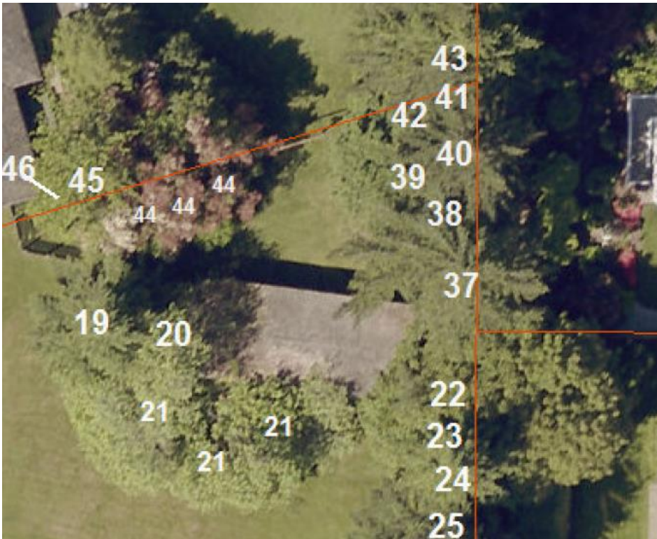
Figure 1. Tree plot for the NE corner. The #19-25 trees are listed and described in the original report.