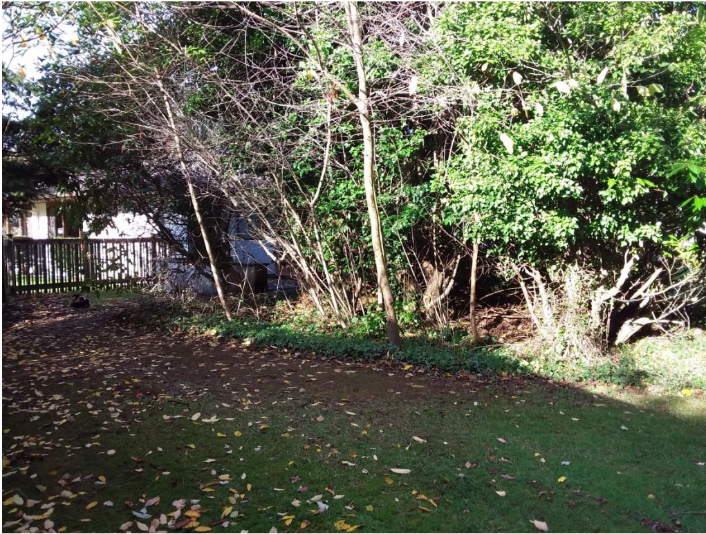
Figure 3. Looking NW at the mixed photinia and volunteer cherries along the north side of the described region.